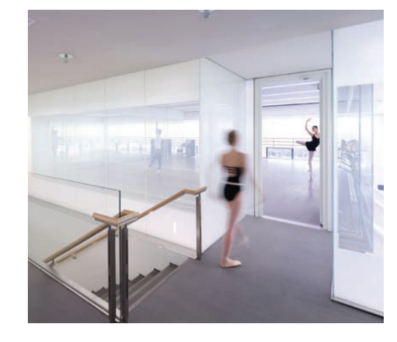
"Wow! Simple and striking."

Elizabeth Diller's idea to stack two dance studios where previously there had been one, posed an enormous lighting challenge — how to assure both studios are desireable and that the dancers on the lower level feel that they're part of the larger volume.